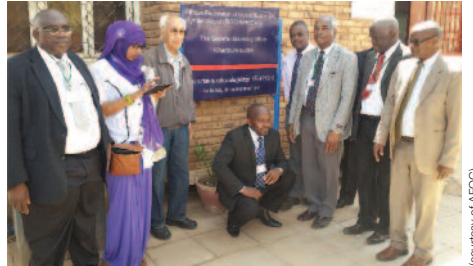
Outside the new AFOG Secretariat in Khartoum

In late February, I travelled to Khartoum to attend the General Assembly of the African Federation of Obstetrics and Gynecology (AFOG), FIGO's most recently recognised Regional Federation. This took place during the 26th Congress of the Sudanese Obstetrical and Gynaecological Society. The meeting was attended by representatives of 22 societies of African Obstetrics and Gynecology. Discussions to