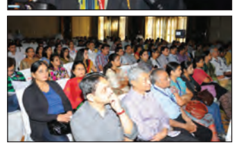
World Congress on Population Stabilization & Women's Health - July 7-8, 2012, Jaipur