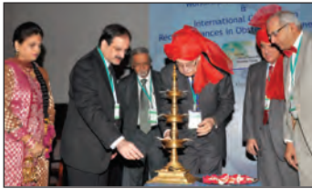
FOGSI-FIGO Conference – April 6-8, 2012, Mumbai