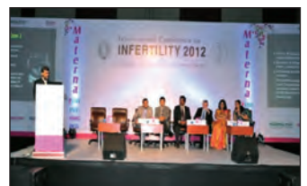
ICI 2012 – International Conference on Infertility - December 16-17, 2012, Hyderabad