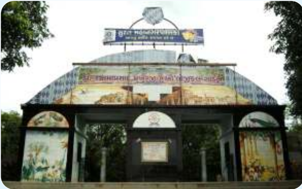
Sarthana Nature Park