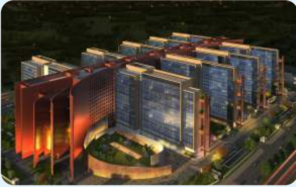
Surat Diamond Bourse