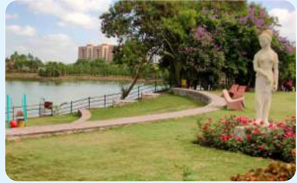
Sneh Rashmi Botanical Garden