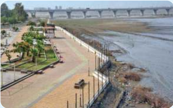
Tapi River Front