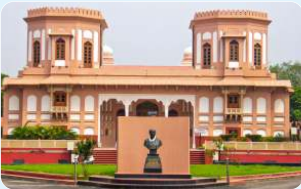
Sardar Patel Museum