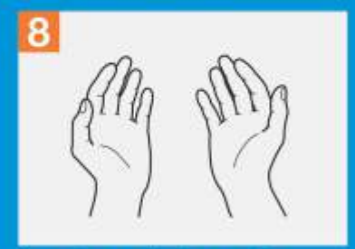
Once dry, your hands are safe.