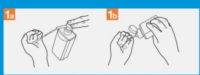
Apply a palmful of the product in a cupped hand, covering all surfaces;