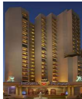
The Royal Plaza