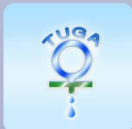
Taiwan Urogynecology Association