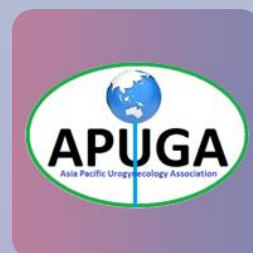
The Asia-Pacific Urogynecology Association