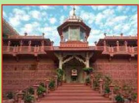
Chamatkarji Jain Temple

Chauth Mata Temple - This Temple is located on a hill top in Chauth ka Barwada village, 35km from Sawai Madhopur city. Chauth Mata is the Kuldevi of Meena community.