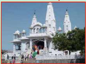
Chauth Mata Temple

Ganesh Temple - This Ganesh temple is situated on the top of Ranthambore fort on Sawai Madhopur. The fort itself is within the national park. The especially of the temple is that, it is the only temple with trinetradhari (one with three eyes) Ganesh ji.