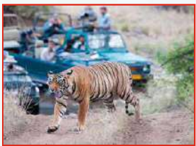
Ranthambore National Park

Ranthambore National Park - The Ranthambore National Park is one of the largest national parks in India. It is situated about 11 kilometres (6.8 mi) from Sawai Madhopur. In 1955, it was established as the Sawai Madhopur Game Sanctuary. In 1973, the land became a Project Tiger reserve. The area was renamed the Ranthambore National Park in 1980. In 1984, the adjacent forests were declared the Sawai Man Singh Sanctuary and Keladevi Sanctuary, and in 1991 the tiger reserve was enlarged to include Sawai Man Singh and Keladevi sanctuaries.