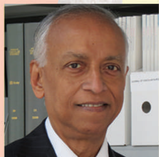
Sir Sabaratnam Arulkumaran (United Kingdom)