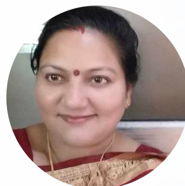
FOGSI MTP Committee Chairperson Head of Dept, Obs and Gyn Muzaffarnagar medical college