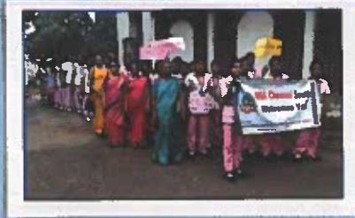
15.3.18 Women's day celebration