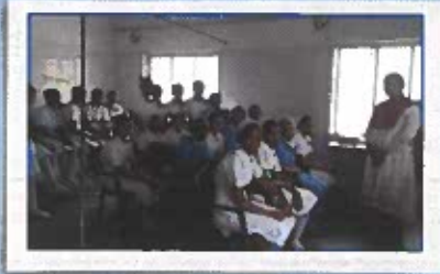
NURSES DAY 14.5.18 – Members from Chennai

18. NURSES DAY 14.5.18 – Members from Chennai(4), Salem, Pudukottai, Thiruvannamalai, Villupuram and Chengal pattu Medical Colleges conducted Adol Health sessions for nursing students in 8 medical colleges in Tamilnadu