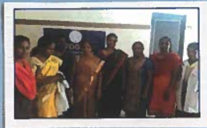
ADOLESCENT HEALTH CMEs THIRUVANNAMALAI Society ToT 24.2.18