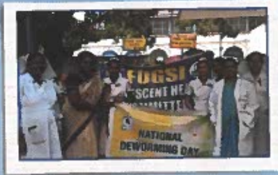
CHENNAI SOCIETY 10.2.18 DEWORMING DAY

Rally in the morning by Nursing students of IOG -150 students Counseling session on adol health in the afternoon with Queen Mary's College-250 students