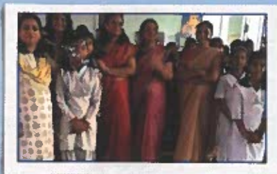
Joint Collaboration with Government of India- Mission Pink