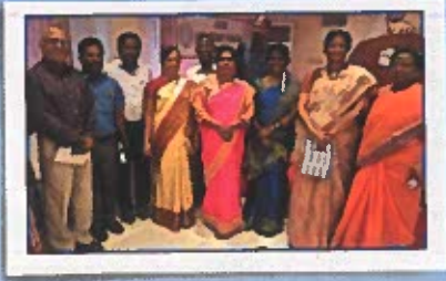
KANCHEEPURAM 15.3.18 with KANCHI IMA doctors – CME ON ADOLESCENT HEALTH