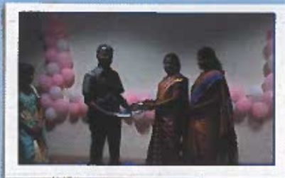
TIRUPATTUR OG FORUM 29.4.18