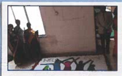
JALGAON - 19.7.18