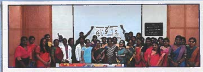
MADHA MEDICAL COLLEGE 14.3.18 - 350 Doctors participated

6. MADHA MEDICAL COLLEGE 14.3.18 - 350 Doctors participated