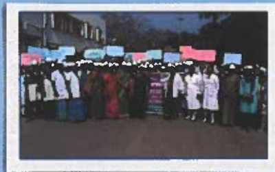
INTERNATIONAL WOMEN'S DAY 7.3.18

1. 17.3.18 CHENGALPATTU OG FORUM - 200 Students, Doctors & Nurses participated in the Walkathon for 3 km on 'WOMEN'S HEALTH' Walkathon by Medical College and Arts College students numbering more than 1000 students on 'Women Empowerment'. It was inaugurated by the Dean, followed by Counselling session on Adolescent Health for students.