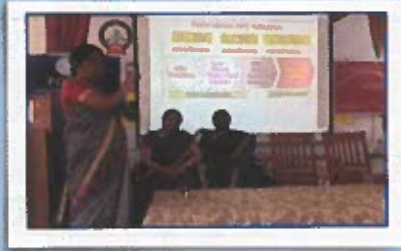
CANCER DAY CME on 25.2.18

3. Cancer Day CME on 25.2.2018 at Aruna Vidya Arts & Science College, Kannakurukkai, 226 kms from Chennai.