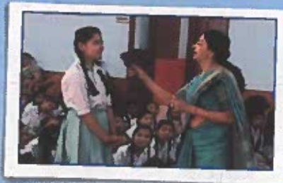
National co-ordinator Adolescent Health Committee FOGSI