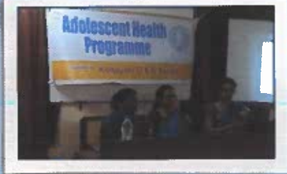
KOTTAYAM SOCIETY 27.2.18 -- 68 Doctors Participated

4. KOTTAYAM SOCIETY 27.2.18 -- 68 Doctors Participated