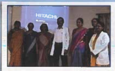
ELURU SOCIETY 18.5.18