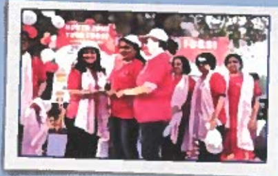
North Zone Yuva FOGSI, Dehradun