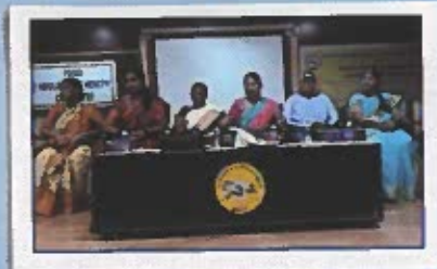
TRICHY SOCIETY 17.4.18 - National conference