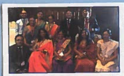
PUNE SOCIETY 24.4.18 – PANEL