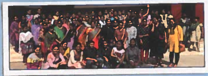
AHMEDABAD SOCIETY 20.5 18