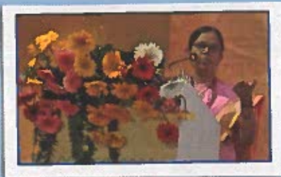
AICOG 2018 at BHUVANESWAR