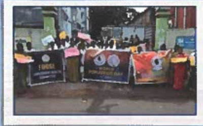
World Population Day - 17.7.18

Walkathon on awareness of contraception at TRIPLICANE, KGH hospital by doctors and nurses-150 participated