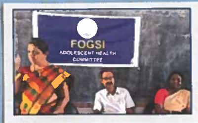
ADOLESCENT HEALTH CLINIC STARTED AT THIRUKOVILUR