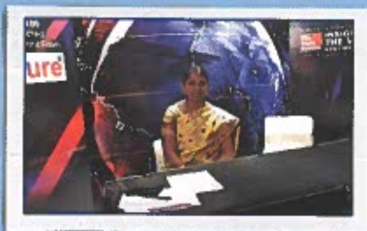
YOU TUBE RECODING AT WOMEN's SUMMIT, GURUGRAM 1.6.18