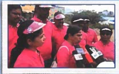
SALEM SOCIETY 24.8.18

Walkathon by 680 students and 50 OG doctors on Cancer Awareness followed by Public Forum