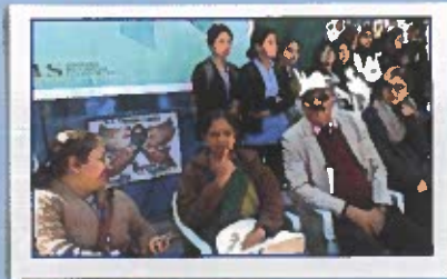
EAST ZONE YUVA FOGSI 22.11.18