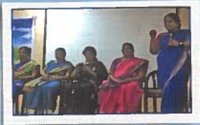
SALEM SOCIETY 24.8.18

ADOLESCENT COUNSELLING on nutrition, menstrual health, mental health, sexual health and vaccination were done at Dr. Ambedkar Arts College with OGSSI President & Secretary